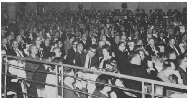
Annual Banquet in the Pavillon Caprice, Netherland Hotel.

The results of sincere effort were made visible at the Fall Meeting, and we have these committee members and the entire contributing membership to thank for a highly successful meeting.